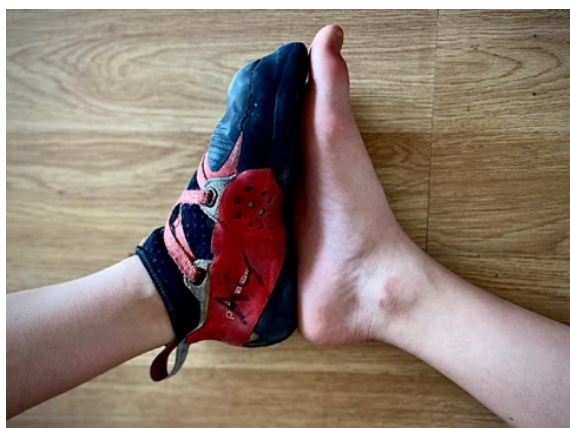
Figure 1. Length of cat’s paws with length of the foot.

Climbing involves a series of acyclic movements that seek to move the body, actively involving both the hands and feet. As for the movements of the lower body, there are different technical gestures whose main objective is to bring the center of gravity closer to the wall. One such movement is the heel hook, which involves placing the heel on a foothold. In contrast, the “toe hook” movement involves applying pressure against a foothold using the back of the foot. To accompany this sporting movement, special technical footwear called “climbing shoes” is required 6,7 . Cat’s paws are specialized technical footwear for climbing, i.e., shoes designed for climbing walls, whether on natural rock or in indoor facilities such as climbing walls. They have a special design and characteristics for this purpose 7 . They are very light, flexible, and grippy, thanks to the special adhesive rubber on the sole, side bands, and front, which provides greater grip and precision. Initially, they were made of leather, but over the years and with industrial advances, different technical materials have been used that give them other or better characteristics than leather. However, this material continues to have its fans due to its price, durability, and adaptability. Attributes such as the concave shape that exerts pressure on the toes and the asymmetry that concentrates pressure on the big toe are basic elements of modern climbing shoes (Figure 1) 7,8 .