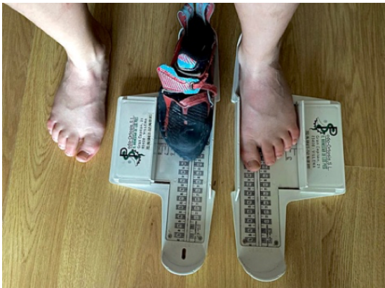
Figure 3. Foot length vs. climbing boot.

Almost 70 % of climbers have a cat length shorter than their foot length (which is the same number of small “cat paws”), with a significant difference between foot length and cat length (p-value 0.010; Wilcoxon signed-rank test), with a difference of almost two sizes between foot size and “cat paw” size.