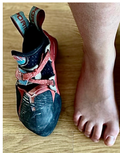
Figure 2. Hallux valgus of the climber.

A descriptive, cross-sectional, prospective study was carried out. The participants were regular climbers at the Cerzawall climbing wall in Plasencia (Extremadura, Spain) and were members of the FEXME (Extremadura Mountain and Climbing Federation).