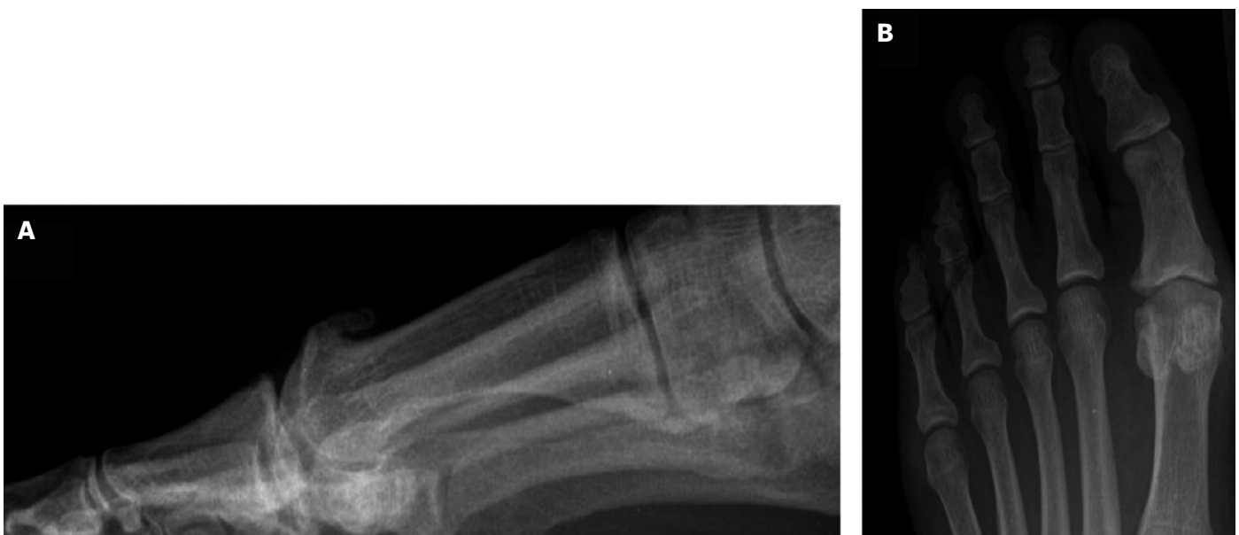
Figure 1. A: standard lateral weight-bearing radiograph showing the first dorsal metatarsophalangeal osteophytes. B: anteroposterior radiograph with evidence of joint space narrowing.

Arthroscopic treatment of HR has emerged as a viable option in studies 5 , offering early recovery and rapid rehabilitation, relieving