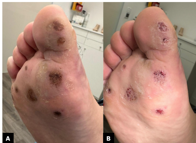
Figure 6. Postoperative appearance 48 hours after the intervention. Shown before debridement (A) and after debridement (B).

A change in the appearance of the lesions is noted, with the wounds appearing much drier vs 48 hours post-treatment. At this stage, the lesions can be debrided without any issues. Hyperkeratosis was removed with a scalpel (including from the untreated