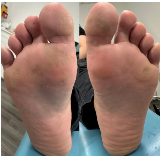
Figure 9. Appearance of both feet 1 month after the intervention.

with only minor areas of hyperkeratosis present due to metatarsal overload.