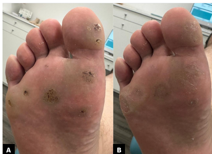
Figure 7. Appearance 15 days after the intervention. Shown with the treated foot before debridement (A) and after (B).

contralateral foot, which showed apparent improvement, as seen in Figures 7 and 8).