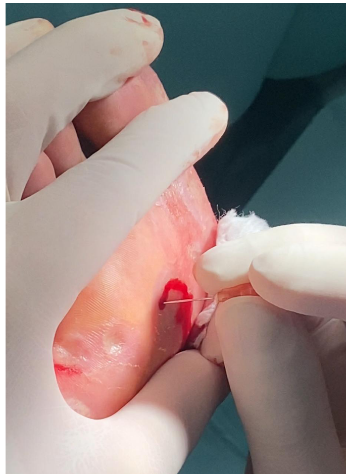
Figure 4. Performing punctures on one of the plantar warts during the intervention.

While waiting for the anesthetic to take effect, the foot was thoroughly washed with a chlorhexidine sponge and ethanol. The clini-