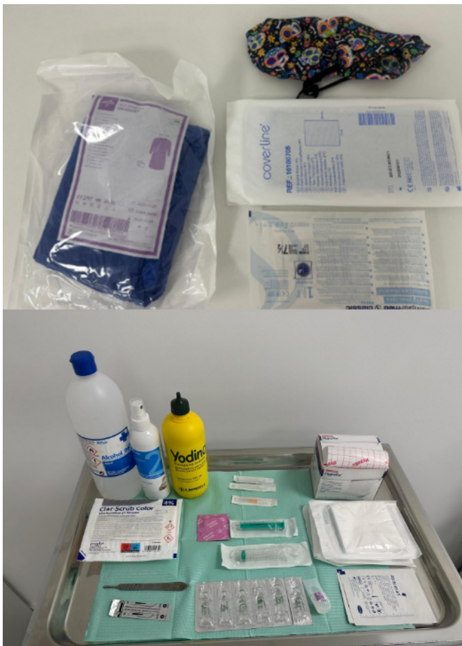
Figure 3. Materials used in the technique: Povidone-iodine, chlorhexidine, 10 mL syringe, 6 mL syringe, 27 G needles (1" and 1 ½"), 2 % mepivacaine (12 mL), 0.5 % bupivacaine (3 mL), ultrasound probe cover, sponge with chlorhexidine, ethyl alcohol, sterile gloves, sterile gown, sterile drape, sterile gauze, 25 G 5/8" needle, scalpel handle n3, scalpel blade n10, Atrauman® (Paul Hartmann AG, Germany), Hypafix® (BSN Medical, Germany).

ment using the multipuncture technique that he accepted. The materials used for the technique are detailed in Figure 3.