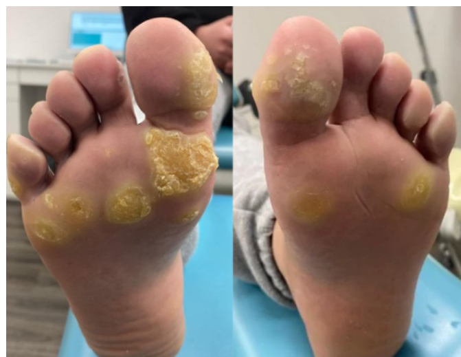
Figure 2. Initial condition of the patient.

Prior treatment with 60% nitric acid was attempted over 11 weekly sessions without success. The patient was subsequently offered treat-