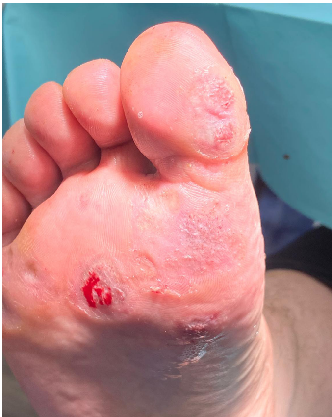
Figure 5. Wound appearance after a few punctures.

analgesics were used to promote a controlled inflammatory response that helps the immune system recognize the papilloma 2 .