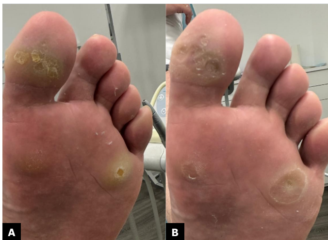
Figure 8. Appearance 15 days after the intervention. Contralateral foot shown before debridement (A) and after (B).