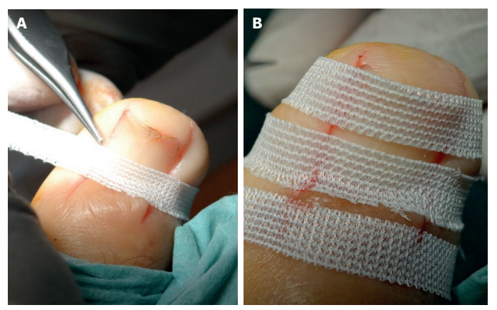
Figure 2. Second modification of the Winograd Technique, using adhesive suture, with sequential and distal placement, the first strip is superimposed on the eponychium (a), and the last on the distal portion of the nail plate (b).

In the postoperative period, patients were advised to keep their feet elevated (at the level of the pelvic girdle), to walk for five minutes every hour from 12 hours after intervention, to wear postoperative