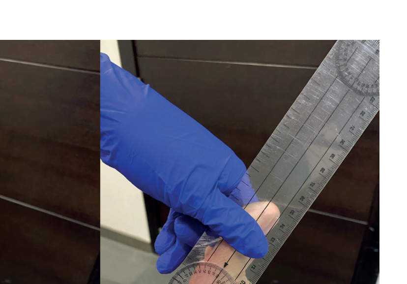
A B Figure 1. Determination of the metatarsophalangeal dorsiflexion. A: neutral position. B: maximun dorsiflexion

lanx, and it was fixed to the hallux with the other hand. From the neutral position (Figure 1A) the hallux was taken along with the distal arm of the goniometer up to the